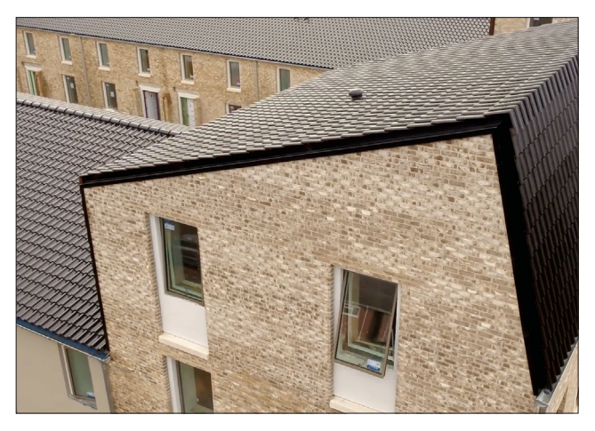
The unique roofing system flows without interruption continuously from eave to ridge.