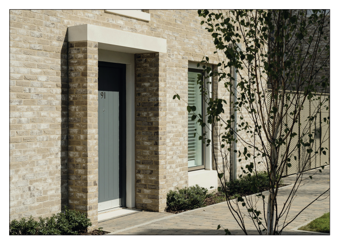
Crest's Belgravia Buff Multi and Grosvenor Multi, a mix of the two brick types created a bespoke and unique blend, now called the Crest Goldsmith Blend which complemented the Victorian terraced housing design.